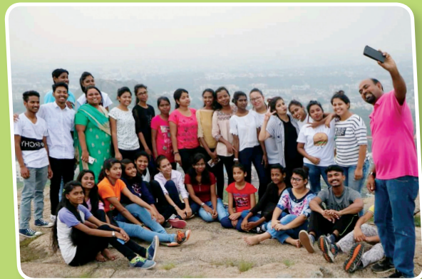
Adventist Youth Outing