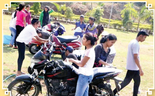
GYD Fundraising Activity