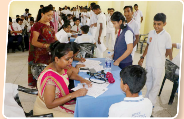
School Medical Camp