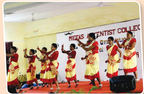
Orientation and Welcome Programme