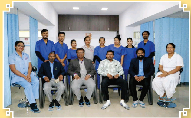
Hospital I.C.U. Team