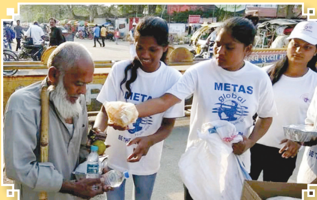
Globe Youth Day