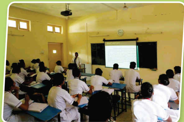
Digital Class Room