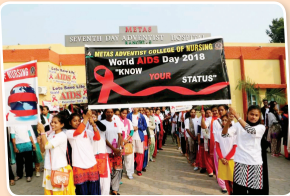
World Aids Day