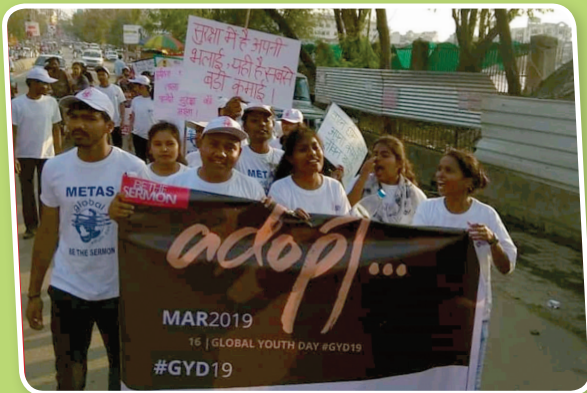
Globe Youth Day