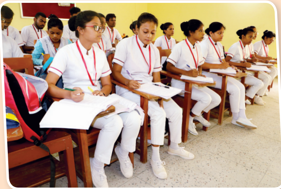
Class Room Activity