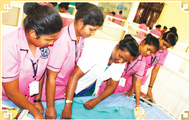
Skill Development Lab