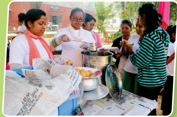
SNA Fund Raising